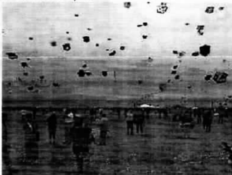
Just part of the Rokakus flying in the mass ascension at AKA National Convention

this event at Ocean Shores the second week of October. This means putting on the early bird reception on Monday evening as well as helping with staffing for some events. More information will be forth coming as this event starts to come together. Please plan to attend this event and possibly volunteer if you can, especially if you have never been to a national convention. It is truly an experience you will never forget.