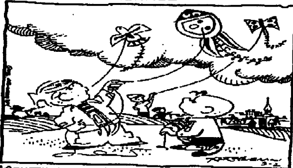
DENNIS THE MENACE

"SOMETIMES I DON'T KNOW THE DIFFERENCE BETWEEN RIGHT AND WRONG, BUT THERE'S ALWAYS SOME GROWN-UP AROUND TO TELL ME."